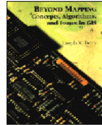
Beyond Mapping book

Characterizing Spatial Coincidence the Computer's Way — describes point-by-point overlay techniques